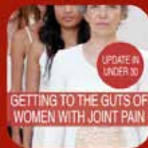
Getting to the Guts of Women with Joint Pain