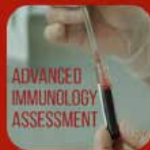
Advanced Immunology Assessment